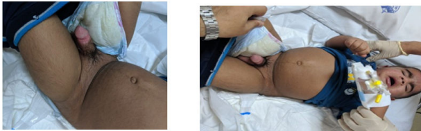
Figure 2. Erected penis with increase in penile width, length and pubic hair.

stimulation test showed negative response. Bone age assessment was advanced by 3 years. All of which confirms the diagnosis of pseudoprecocious puberty. Magnetic resonance imaging of the Abdomen revealed a right-sided retroperitoneal adrenal mass (Figure 3). Based on this clinical picture and imaging, the diagnosis of adrenocortical tumor was made.